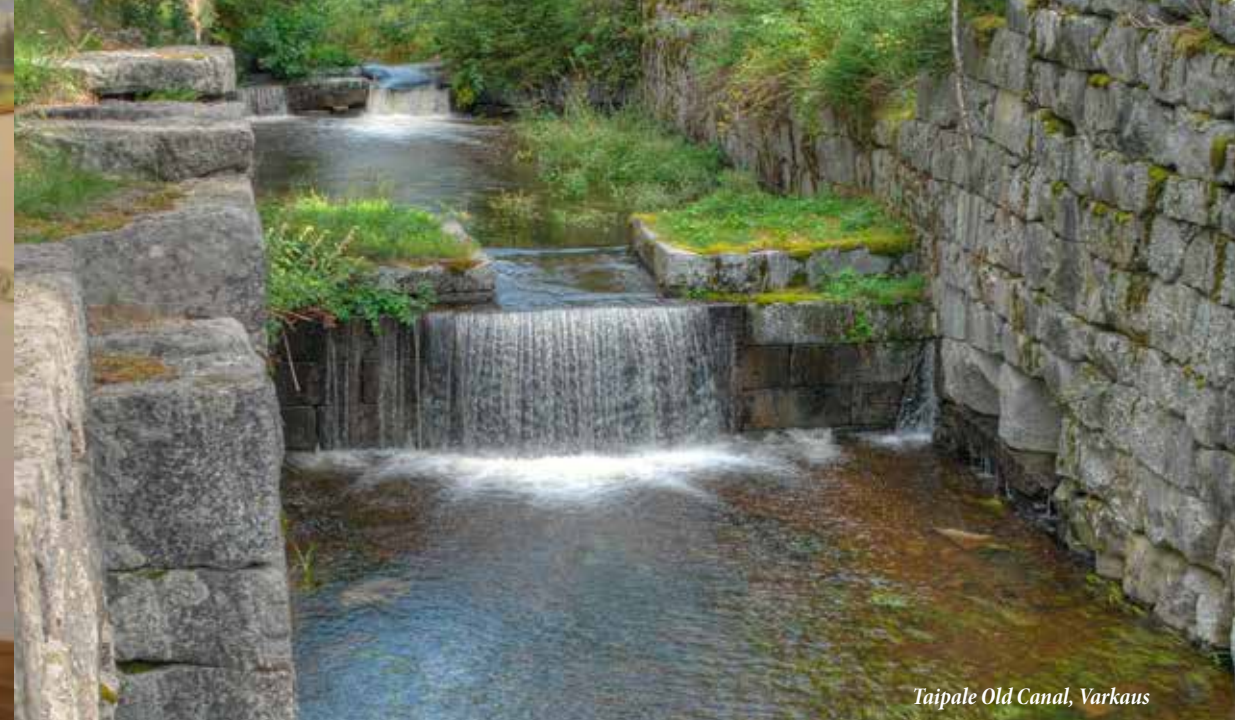
Taipale Old Canal, Varkaus