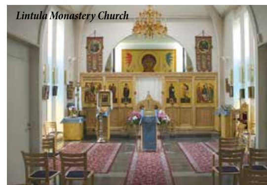
Lintula Monastery Church

Lintula Holy Trinity Convent is open to visitors daily from June to August, as well as on request in May and September-October. The monastery has a café, souvenir shop, guest rooms and monastery tours. Honkasalo 3, 79830 Palokki Tel. office +358 40 485 7603, cafe +358 40 485 7558, shop +358 40 485 7570, guest house +358 40 485 7558 www.lintulanluostari.fi