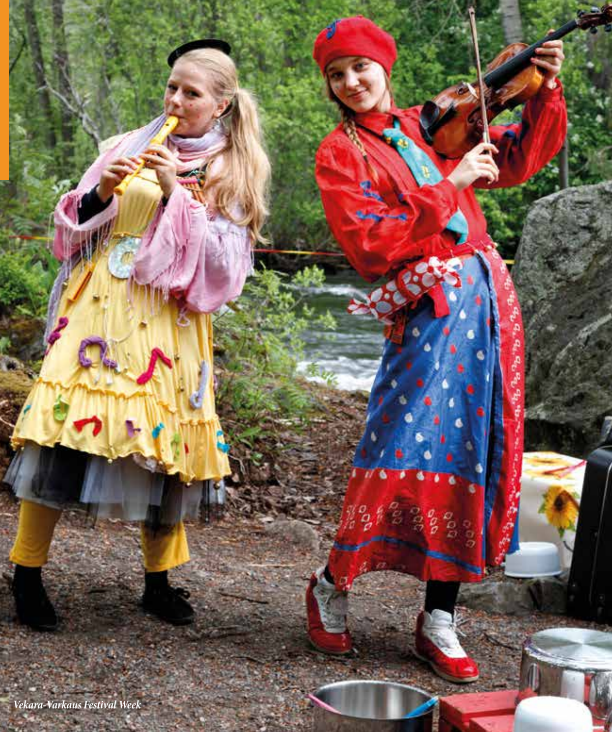
Vekara-Varkaus Festival Week