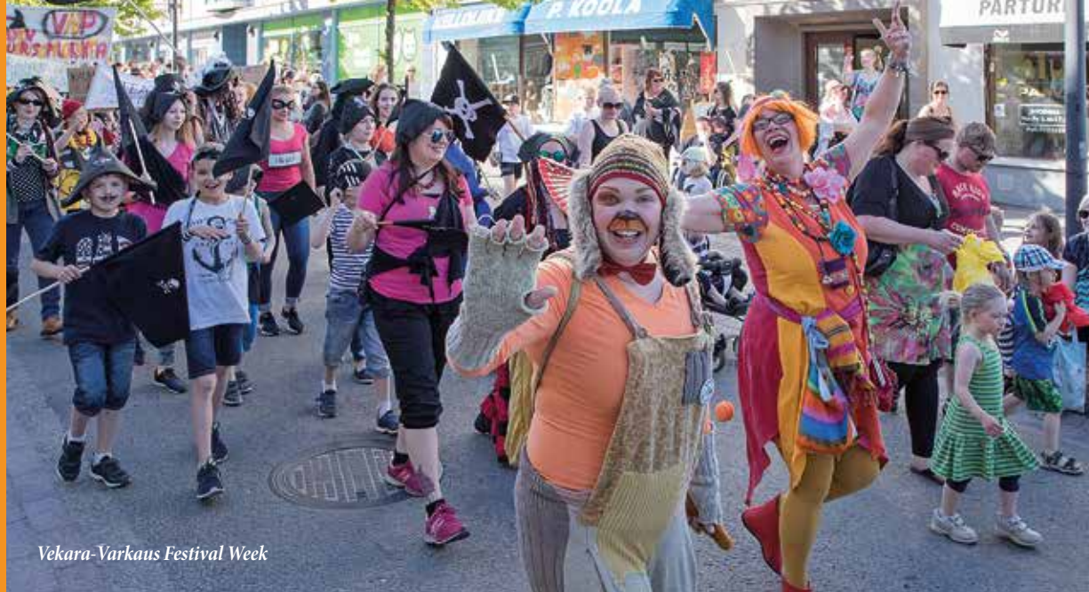
Vekara-Varkaus Festival Week