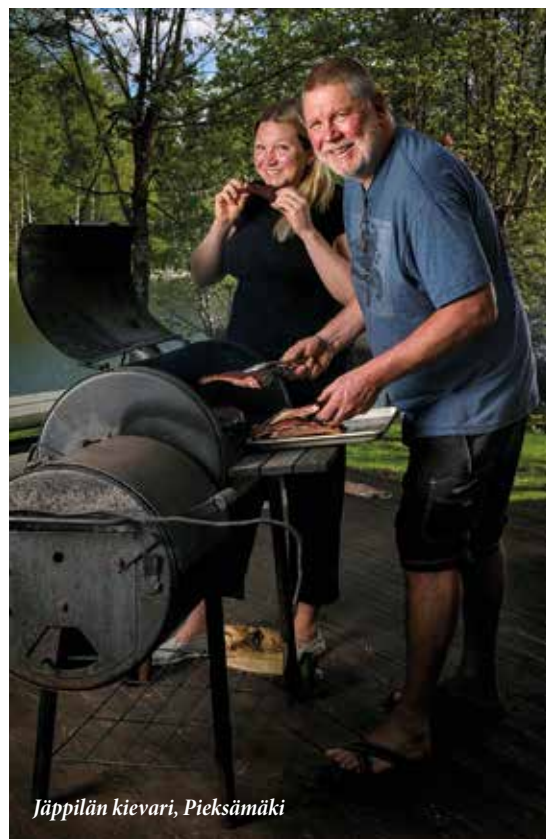
Jäppilän kievari, Pieksämäki