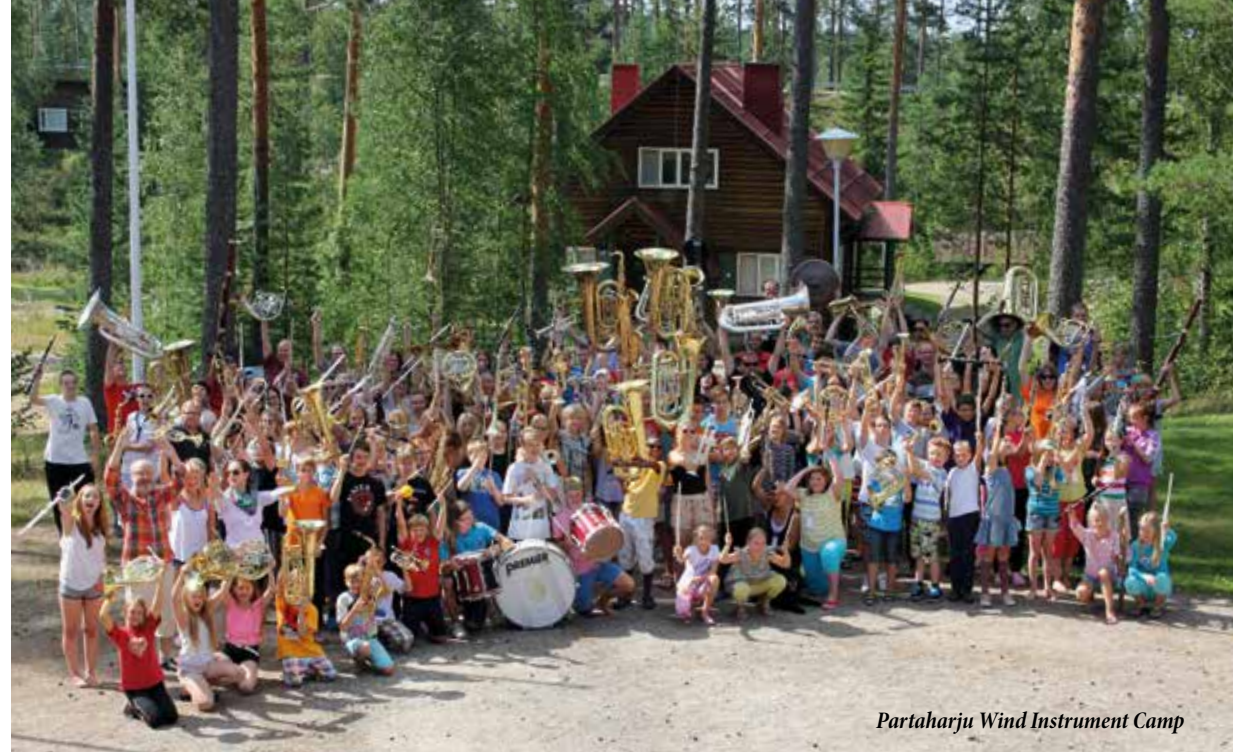
Partaharju Wind Instrument Camp

Since 2005, an art exhibition has been arranged in Heinävesi's bright church in cooperation of the church and the municipality. In the summer 2018, Leena Luostarinen's paitings are on display. Open daily at 11 am - 6 pm.