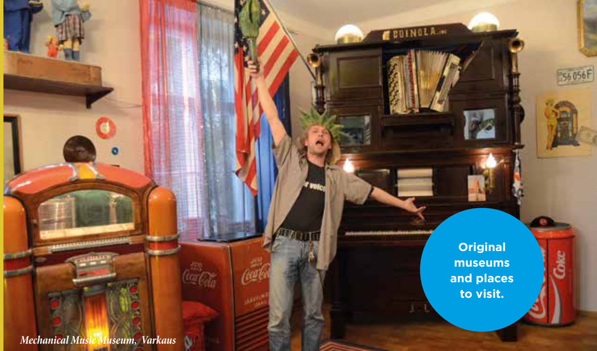
Mechanical Music Museum, Varkaus