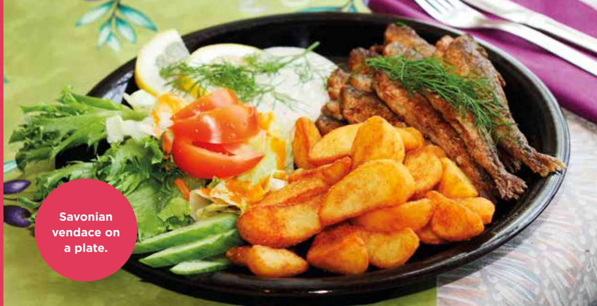
Savonian vendace on a plate.