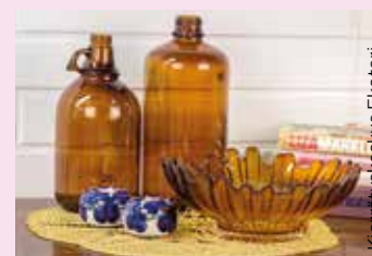
Kiertotie 2 Kiertotie Ekotori

Kauppakatu 42-44, Varkaus Tel. +358 40 650 6801 Facebook / Oranssi kirppis