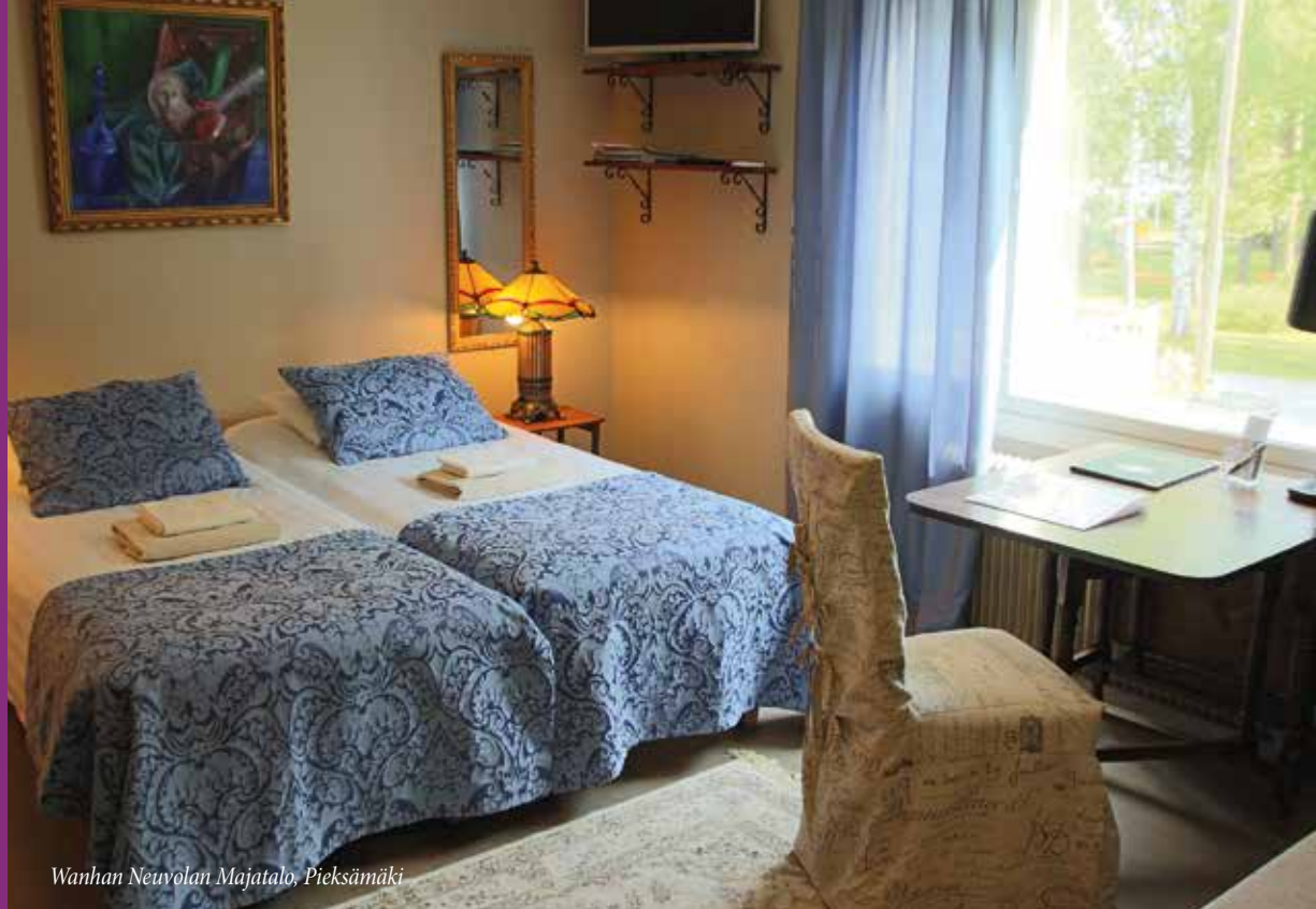
Wanhan Neuvolan Majatalo, Pieksämäki