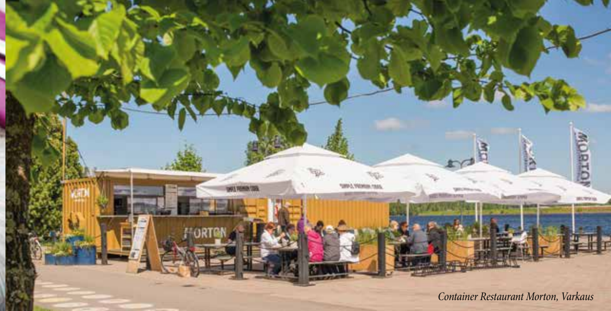
Container Restaurant Morton, Varkaus