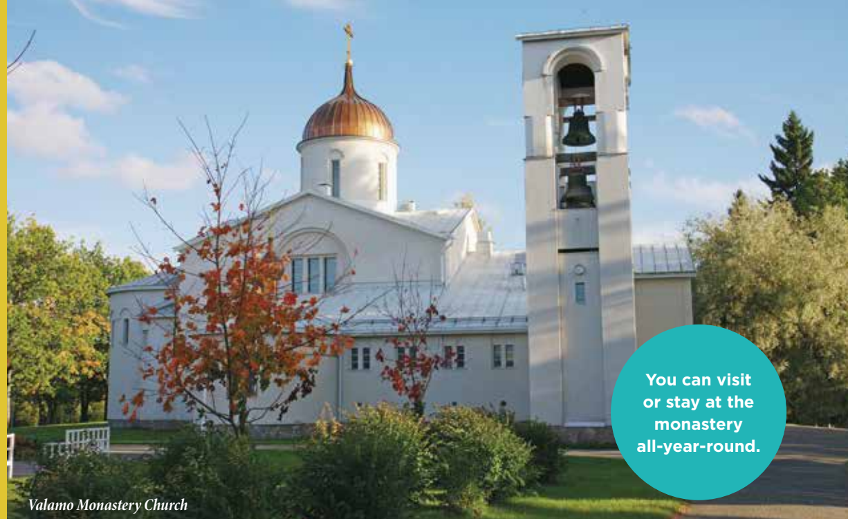
Valamo Monastery Church

You can visit or stay at the monastery all-year-round.